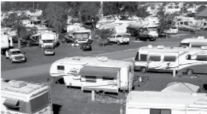
-Prices are subject to change without notice-

*Electric/water/sewage/cable TV & optional phone (where available)