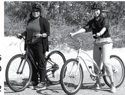
-Prices are subject to change without notice-