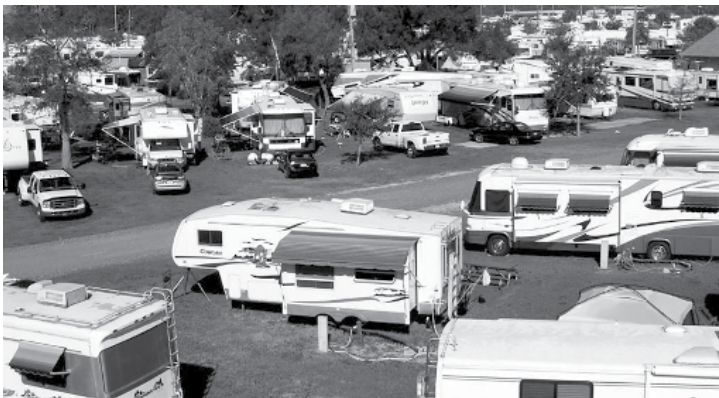
-Prices are subject to change without notice-

*Electric/water/sewage/cable TV & optional phone (where available)