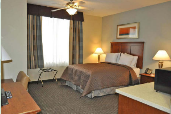
VO ROOM (VISITING QUARTER)